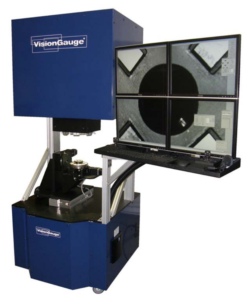
The 700 Series VisionGauge® Digital Optical Comparator 5-axis inspection and measurement system is the ideal solution for the automatic inspection of parts with complex geometries.