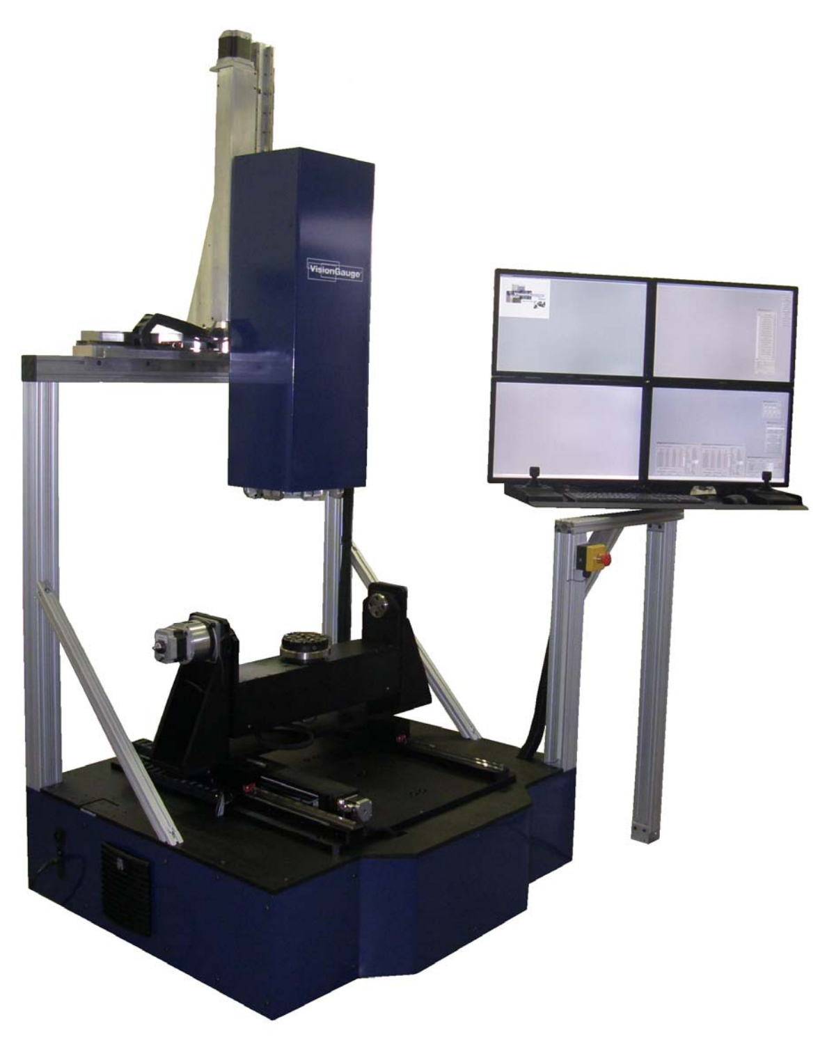
Extended 24" x 24" x 24" travel machine with trunnion configuration for big and heavy parts